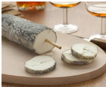
Sainte-Maure-de-Touraine goat cheese