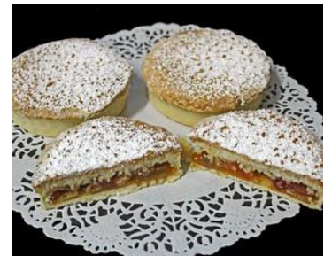
Nougat from Tours