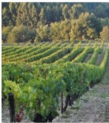
Vineyards in Chinon