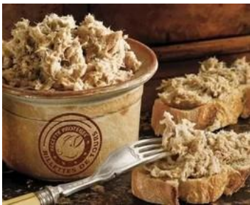
Rillettes from Tours